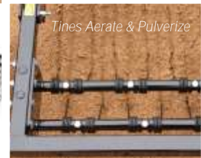
Tines Aerate & Pulverize

For those who need the convenience of “easy travel” our direct mounted “Quick Attach” models remove the burden of tongue towing a groomer or having to trailer it to go from one location to another.