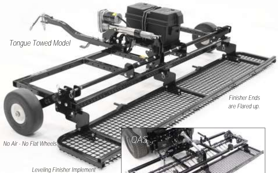
Tongue Towed Model