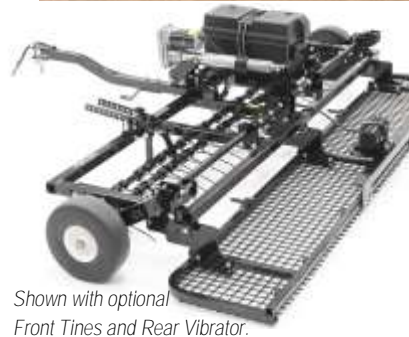
Shown with optional Front Tines and Rear Vibrator.