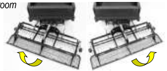
Swivels When You Groom

Rear mount “Quick Attach Swivel” groomers swivel when you groom to create a nicer finish. Most competitor rear attached groomers are rigid when grooming (they don’t swivel) and they can’t produce the same finish. We’ve combined rear quick attached and swivel technology that no competitor has accomplished.... it’s an engineering feat only mastered by Heying Company.