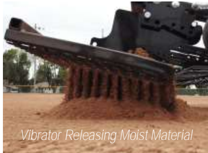
Vibrator Releasing Moist Material

Leveling Them is the Hard Part. The Field Finisher levels and smoothens infields and leaves a professional surface. Great for top surface conditioners. Easy to Use. Optional Vibrator helps sift moist infield material from Finisher. Optional Spring Tines for Aerating and Pulverizing. “Levels and Smoothens Infields”.