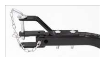
Tongue Hitch Adaptor (included). Adjust Tongue Height.